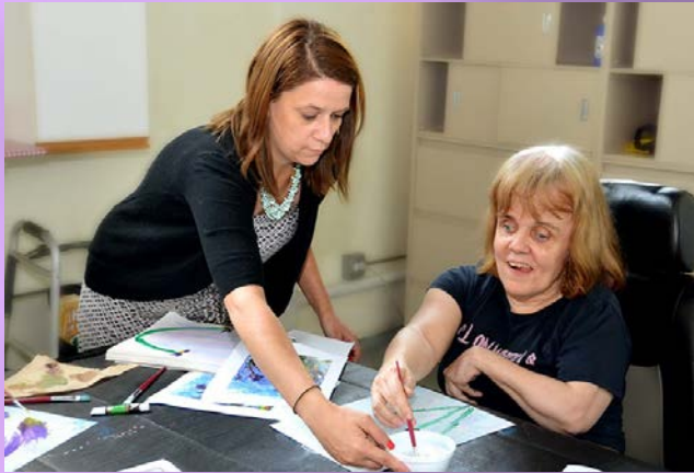
Art studio for Creative Avenues