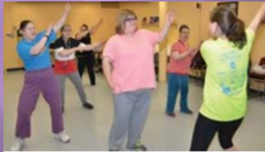
Fitness area to do yoga, Zumba, sports and exercise